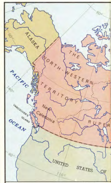
The Province of Canada is formed by uniting Upper Rocky Mountains to the Pacific is described by the Vancouver's Island to develop a colony (1849). New extended boundaries, becomes the colony of British 0