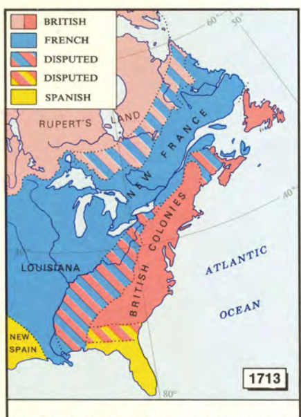
By the Treaty of Utrecht (1713), France cedes Nova Scotia (excluding Cape Breton Island) to Great Britain, relinquishes her interests in Newfoundland and recognizes British rights to Rupert's Land.