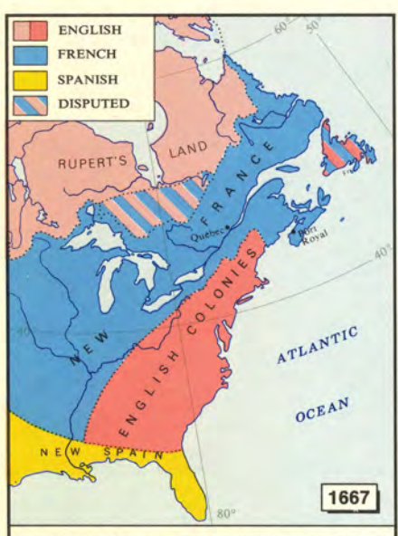
First successful French settlements in North America: Port Royal (1605) and Québec (1608). English settlement in Virginia begins (1606-07). French and English territorial claims overlap Acadia. Acadia is recognized as French possession by the Treaty of Breda (1667). A Royal Charter (1670) grants sole trading rights in Hudson Bay drainage basin to the Hudson's Bay Company.